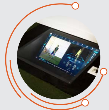
STATE OF THE ART TECHNOLOGY